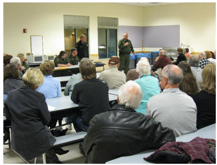
NEMCCA sponsored town hall meeting with the Sheriff