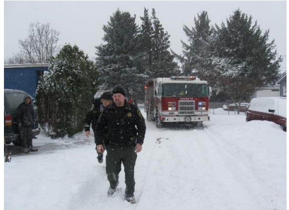
MCSO Deputies walking to a call due to snow/ice